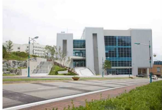
Hallym Recreation Center