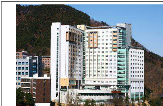
Dormitory (Building 8)