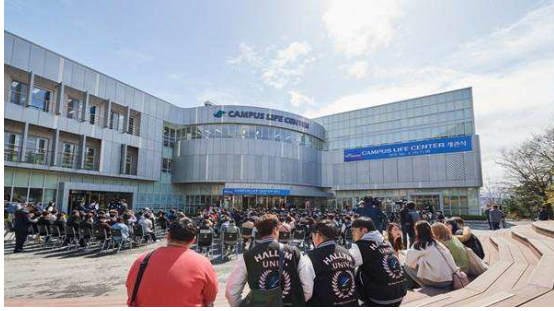
Campus Life Center (CLC)