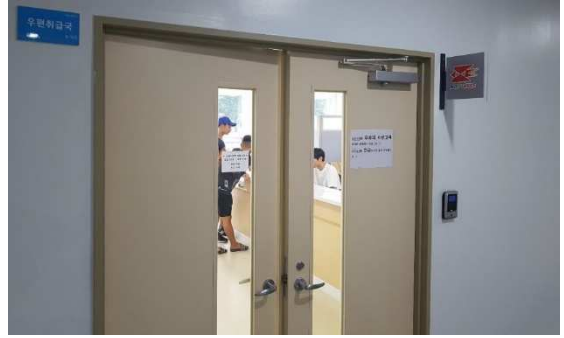
Post office (in CLC)