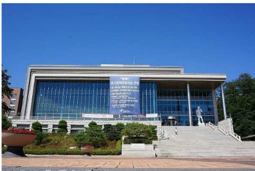
Hallym Ilsong Library

Students can receive discounts upon request.