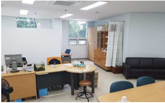
Health Clinic (in CLC)