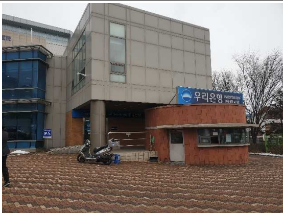
Bank (Woori Bank)