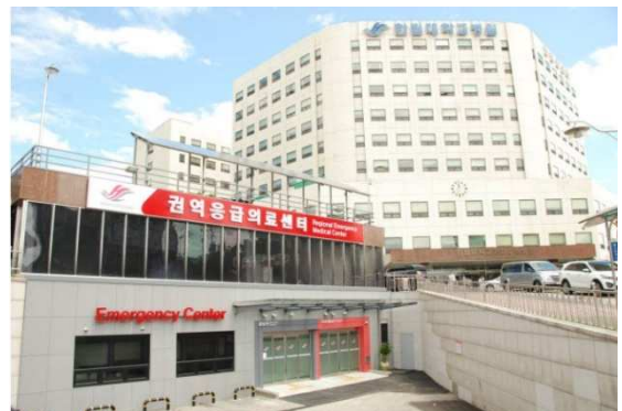
Hospital (Hallym University Hospital)