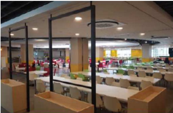
Cafeteria (in CLC)