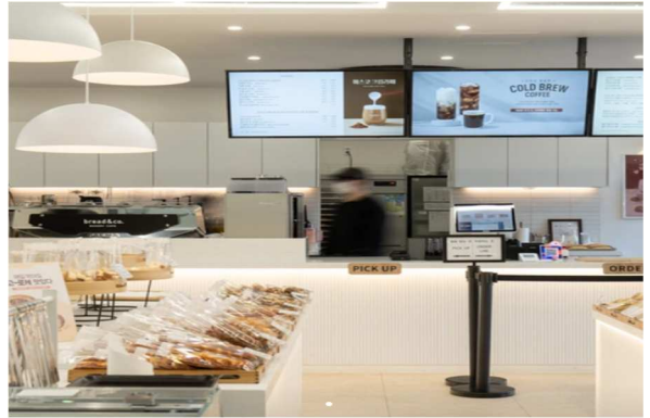
Bakery (in CLC)