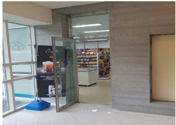
Convenient Store (in CLC)